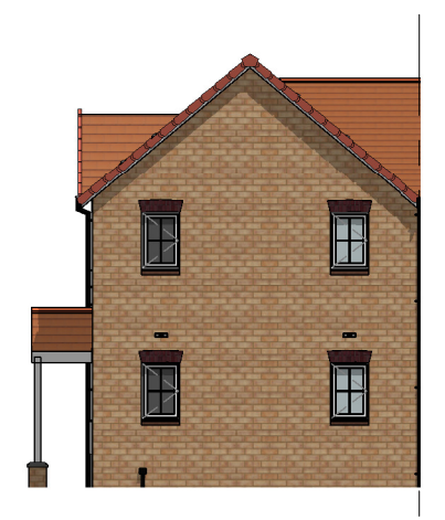
Front Elevation. 1:150