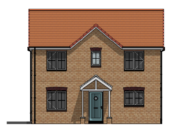
Left Side Elevation. 1:150